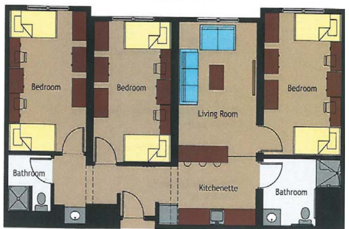
Six Bed Suite

499 West Third Street Berwick, Pennsylvania 18603 800-843-7372 • 570-752-5914 www.deluxebuildingsystems.com